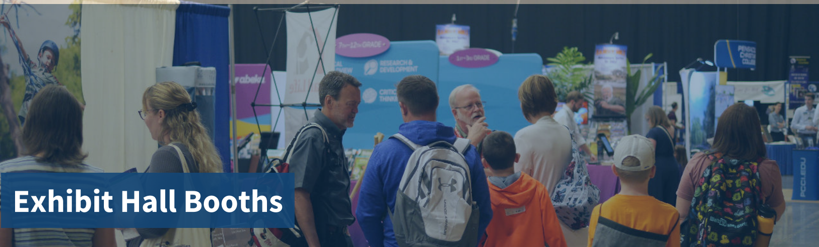
Exhibit Hall Booths